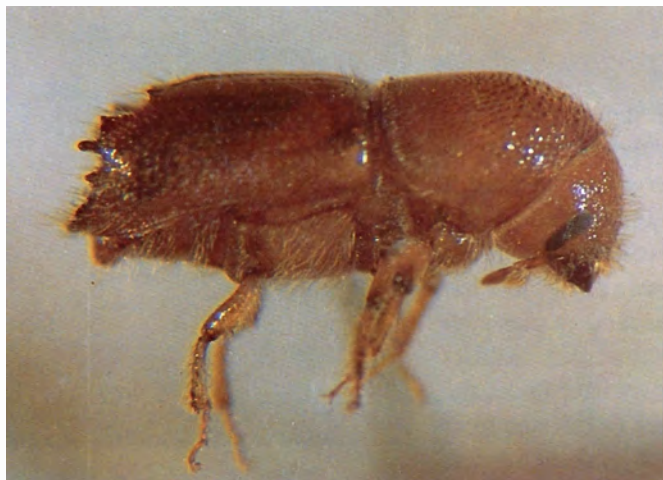
Figure 4. Adult male pine engraver (a "callow" adult). Note prominent posterior declivity and spines.

Ips pini has four stages in its life cycle: egg, larva, pupa, and adult. Eggs are oval, pearly white and about the size of a pinhead. Larvae are creamy-white, legless grubs with brown heads. When full grown, the larvae are about 3/16 inch long. The pupa is soft and white, with some adult features such as eye spots and wing covers.