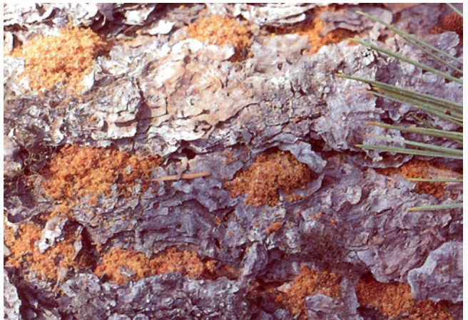
Figure 3. Pine engraver boring dust marking the entry points of beetles.