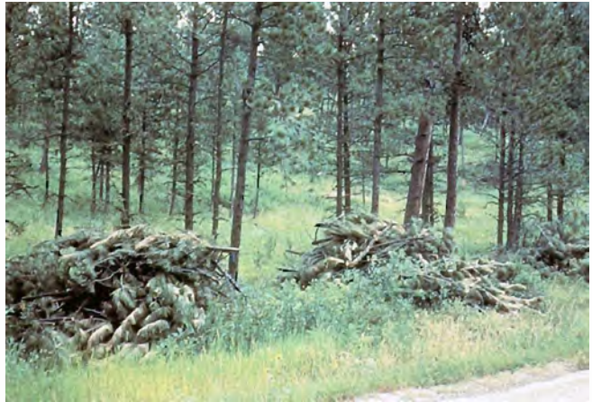
Figure 7. Pine slash susceptible to Ips pini infestation.

Most pine engraver problems are associated with disturbances such as windthrow and snow breakage, drought in spring and early summer, logging, fires, road construction, housing development or other human activities. Pine slash or weakened trees created by these disturbances attract beetles and provide ideal conditions for population buildup and subsequent tree killing (figure 7).