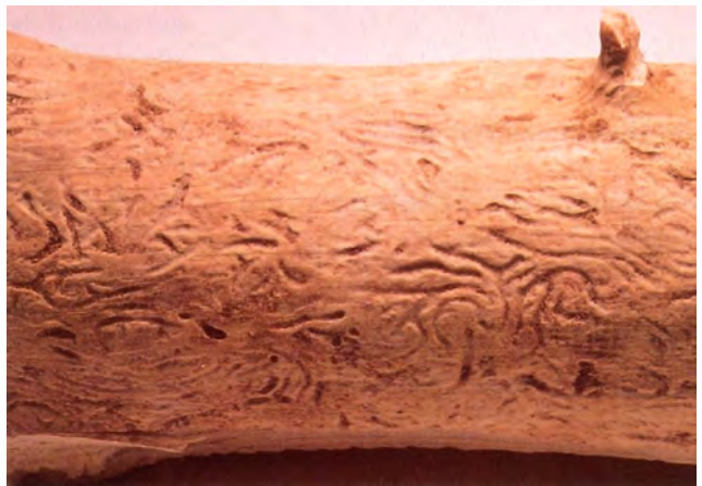
Figure 6. Mazelike galleries of Ips pini produced during feeding attacks in late summer.

In most parts of the beetle's range, two or three generations per year are common. The first flight usually begins in April or May when the daily maximum temperatures reach 60-70 degrees F. As overwintering beetles become active, they infest fresh slash or trees damaged by wind or snow. This generation normally does not successfully attack standing green trees. However, populations can build up in slash with subsequent generations attacking and killing live trees, although if new slash is available, it will be infested first. At high elevations in the north, only one generation occurs in some years. As many as five generations may occur in southern California.