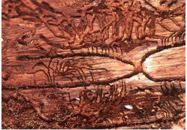
Figure 5. Egg and larval galleries of Ips pini in ponderosa pine.

The beetle spends the winter almost exclusively in the adult stage, except in warmer, drier areas where some older larvae and pupae may overwinter. Adults overwinter under the bark of infested trees and slash or in duff and litter on the forest floor.