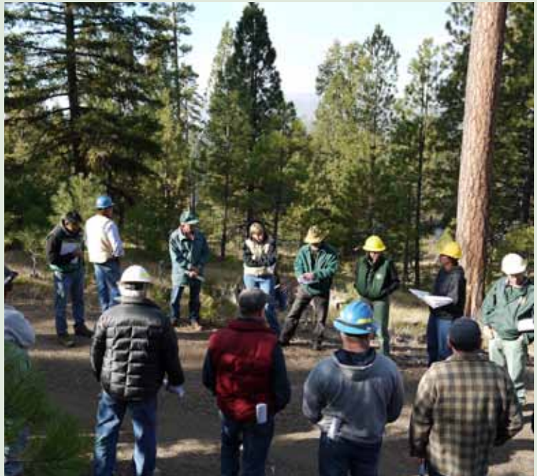
Members of the Central Oregon Partnership for Wildlife Risk Reduction gather during a field trip. The group often conducts multiparty field reviews to discuss how well the project met desired outcomes and share lessons learned to carry forward into future projects.

The Central Oregon Partnership for Wildfire Risk Reduction (COPWRR) uses a type of after-action review to evaluate implementation and outcomes of forest restoration and fuels reduction projects. Participants represent contracting foresters, environmental groups, and resource management agencies, including project interdisciplinary team members. The group evaluates projects using forms that describe the project's original purpose and need, management objectives, silvicultural prescriptions, and best management practices. Participants visit three to five treatment units and discuss how well the project met desired outcomes, what factors arose during implementation that affected the process or outcomes, what adaptations were made along the way, and lessons learned that the group would like to see carried forward into future projects. Through back-and-forth discussion and debate, the group develops a shared project evaluation and recommendations for future management, which then become part of the group's permanent record.