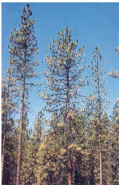
Figure 2 —Scale-infested ponderosa pines near Burney in northeastern California.

bodies, often tightly packed against each other, can be seen along the needles. (See cover photo. Scales are magnified approximately eight times.)