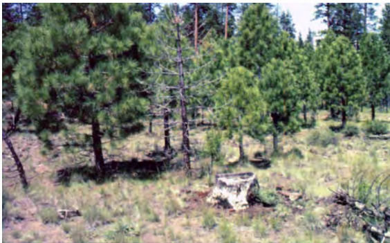
Fig. 11. An annosus root disease center in young ponderosa pine.

but mortality is manifested mainly on the poorer sites. There are indications that H. annosum readily infects pines on better sites but causes mainly growth loss rather