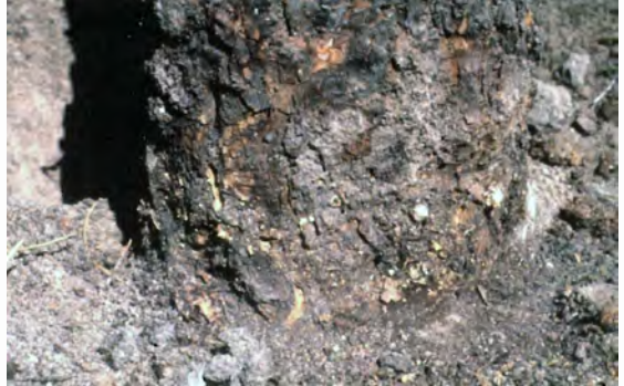
Fig. 1. Small button conks of Heterobasidion annosum on the root collar of a ponderosa pine. Note: these were formed below the duff layer, which was removed for this photograph.

Large conks often grow in the interiors of hollow or extensively decayed hemlock,