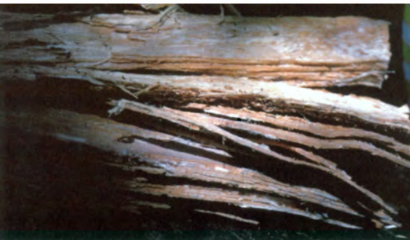
Fig. 6. Typical laminated advanced decay caused by H. annosum .

A light, tawny-brown colored fungal growth may be found on the exteriors of infected roots of pines, true firs, and Douglas-fir (fig. 4). This serves as the primary mechanism for root to root spread, growing along the surface of roots and moving onto the roots of adjacent trees across contacts and grafts. Some other root disease fungi form similar mycelia, and its occurrence alone cannot be used to diagnose the disease.