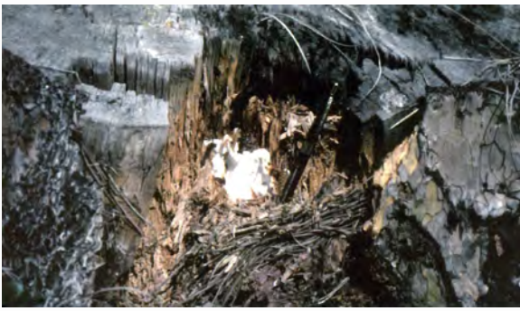
Fig. 3. Mature H. annosum conk in the interior of a ponderosa pine stump