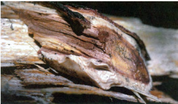
Fig. 5. Characteristic red stain in the interior of a live H. annosum -infected grand fir root.