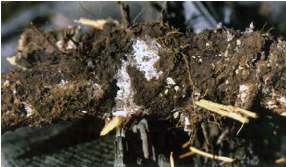
Fig. 4. Ectotrophic mycelia on the exterior of an infected root.