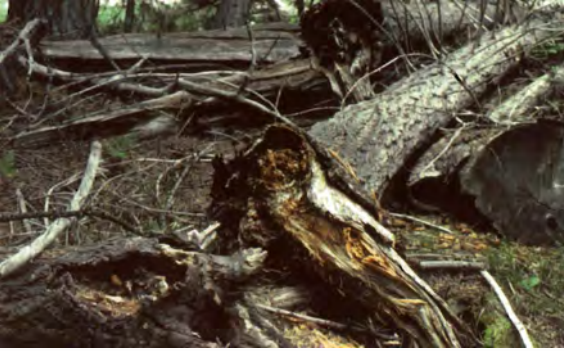
Fig. 9. A small annosus root disease center with several topped grand fir.

Disturbances associated with high use areas such as campgrounds and other recreation areas in hemlock types will predispose trees to large amounts of H. annosum infection. Hazard tree potential will likely be a major concern, especially in older trees.