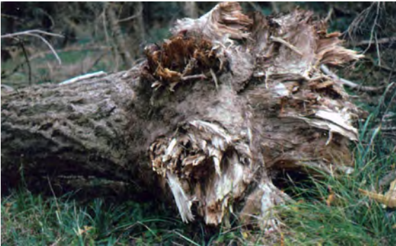
Fig. 10. A recently toppled H. annosum infected grand fir with extensively rotted roots showing the characteristic laminated decay.