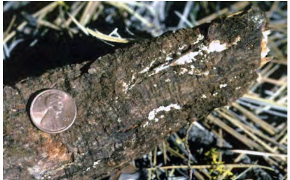
Fig. 2. Characteristic buff-colored pustules that form on the exterior of H. annosum -infected roots.

true fir, and ponderosa pine stumps and roots (fig. 3) or under the bark of decaying pine stumps. Fully mature fruiting bodies may be 10 inches (25 cm) across or larger. H. annosum conks have a buff to dark brown-colored upper surface with concentric furrows and a smooth, cream-colored under surface that has tiny pores and a narrow sterile (non-pored) margin. Conks are perennial and may have more than one tube layer.