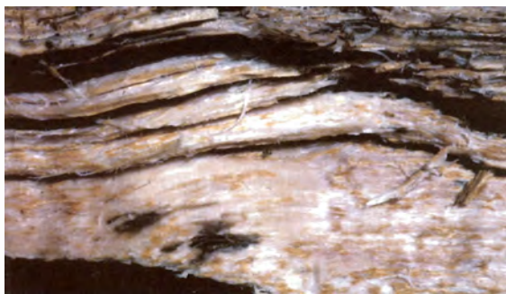
Fig. 7. White streaks and black flecks throughout wet spongy advanced decay most often found on H. annosum -infected grand fir, Douglas-fir or hemlock.